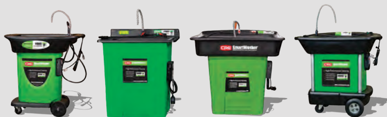
SW-23* Mobile Parts/Brake Washer SW-25* Signature Parts Washer SW-28 SuperSink Parts Washer SW-37 Mobile Heavyweight Parts Washer