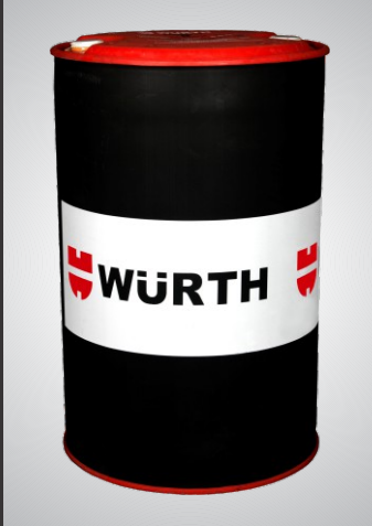
HLP 46 HLP 68

Wurth HLP Hydraulic oil are blended from selective base oils and premium anti wear additives to meet stringent operational conditions of Hydraulic Systems.