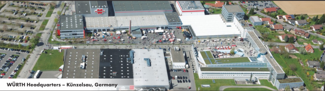
WÜRTH Headquarters – Künzelsau, Germany